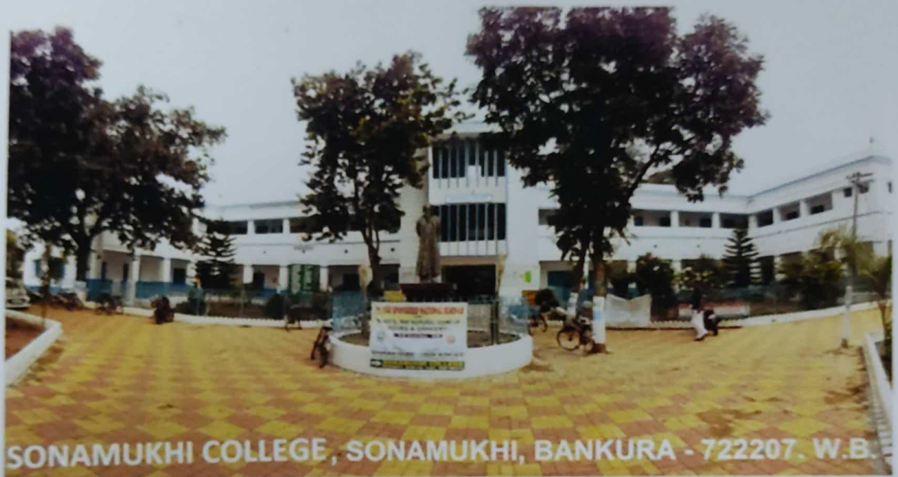
SONAMUKHI COLLEGE, SONAMUKHI, BANKURA - 722207. W.B.

(U.G.College affiliated to The University of Burdwan since 1966 & to Bankura University from Academic Session 2018-19)